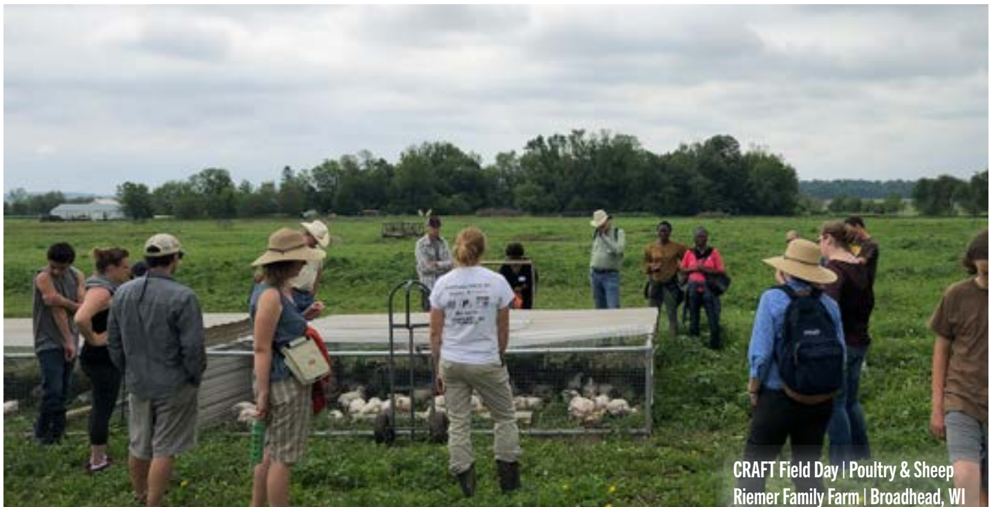
CRAFT Field Day | Poultry & Sheep Riemer Family Farm | Broadhead, WI